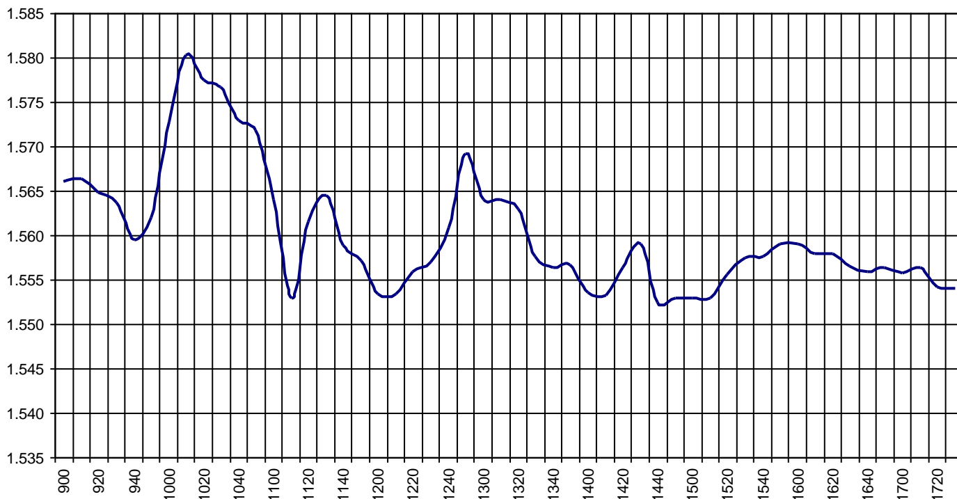
Valor medio del índice IBEX Growth Market 15 cada 10' (Index Average every 10')