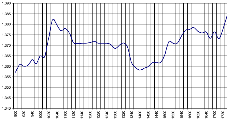
Valor medio del índice IBEX Growth Market 15 cada 10' (Index Average every 10')