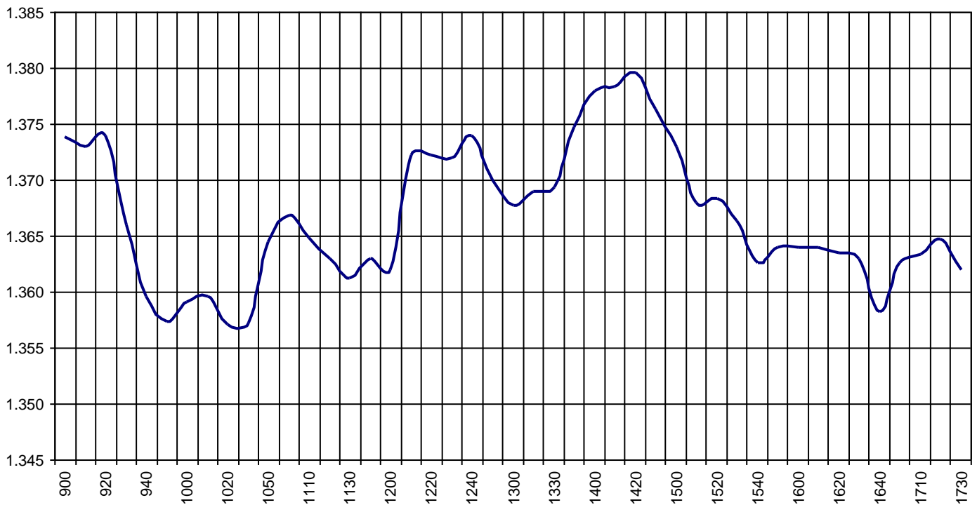
Valor medio del índice IBEX Growth Market 15 cada 10' (Index Average every 10')