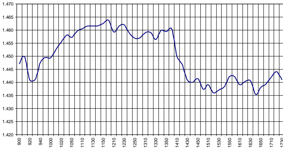
Valor medio del índice IBEX Growth Market 15 cada 10* (Index Average every 10')