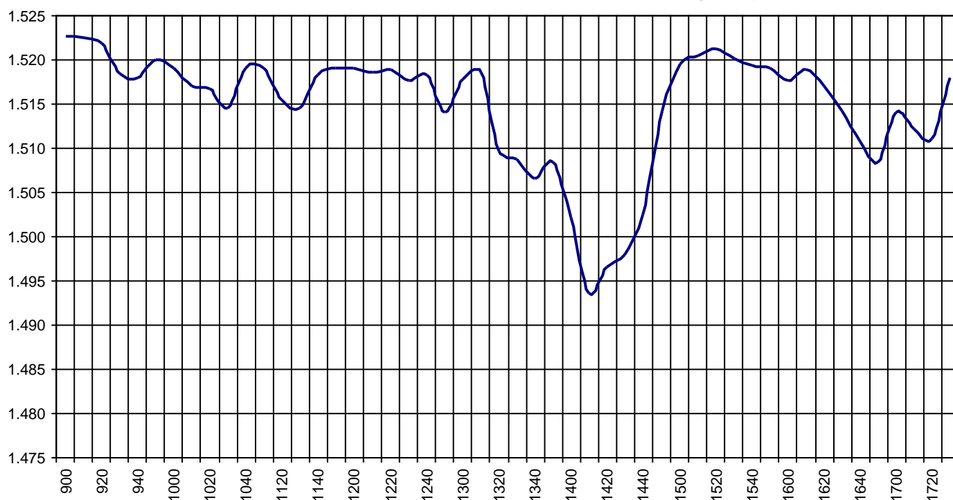
Valor medio del índice IBEX Growth Market 15 cada 10' (Index Average every 10')