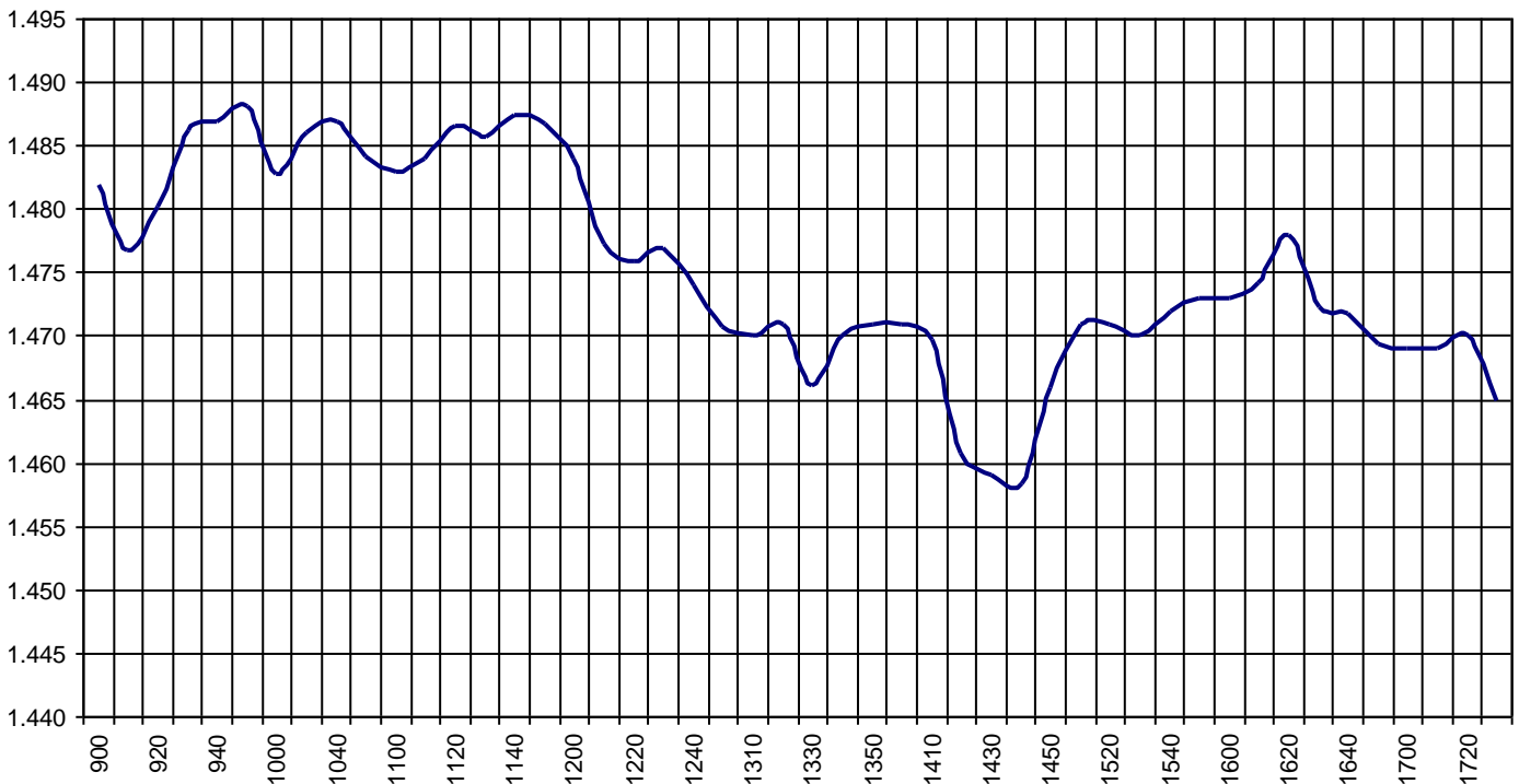
Valor medio del índice IBEX Growth Market 15 cada 10' (Index Average every 10')